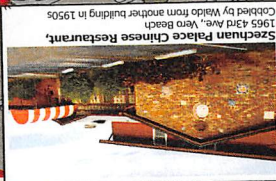
Szechuan Palace Chinese Restaurant, 1965 43rd Ave., Vero Beach Cobbled by Waldo from another building in 1950s