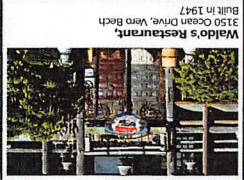
Waldor's Restaurant, 3150 Ocean Drive, Vero Beach Built in 1947