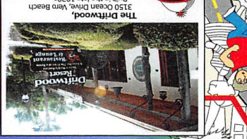
The Driftwood, 3150 Ocean Drive, Vero Beach Built in the late 1930s