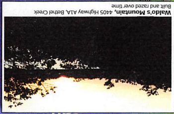
Waldor's Mountain, 4405 Highway A1A, Bethel Creek Built and razed over time