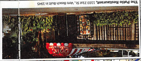
The Patio Restaurant, 1103 21st St., Vero Beach Built in 1945