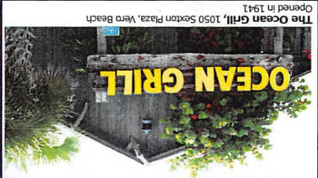
The Ocean Grill, 1050 Sexton Plaza, Vero Beach Opened in 1941